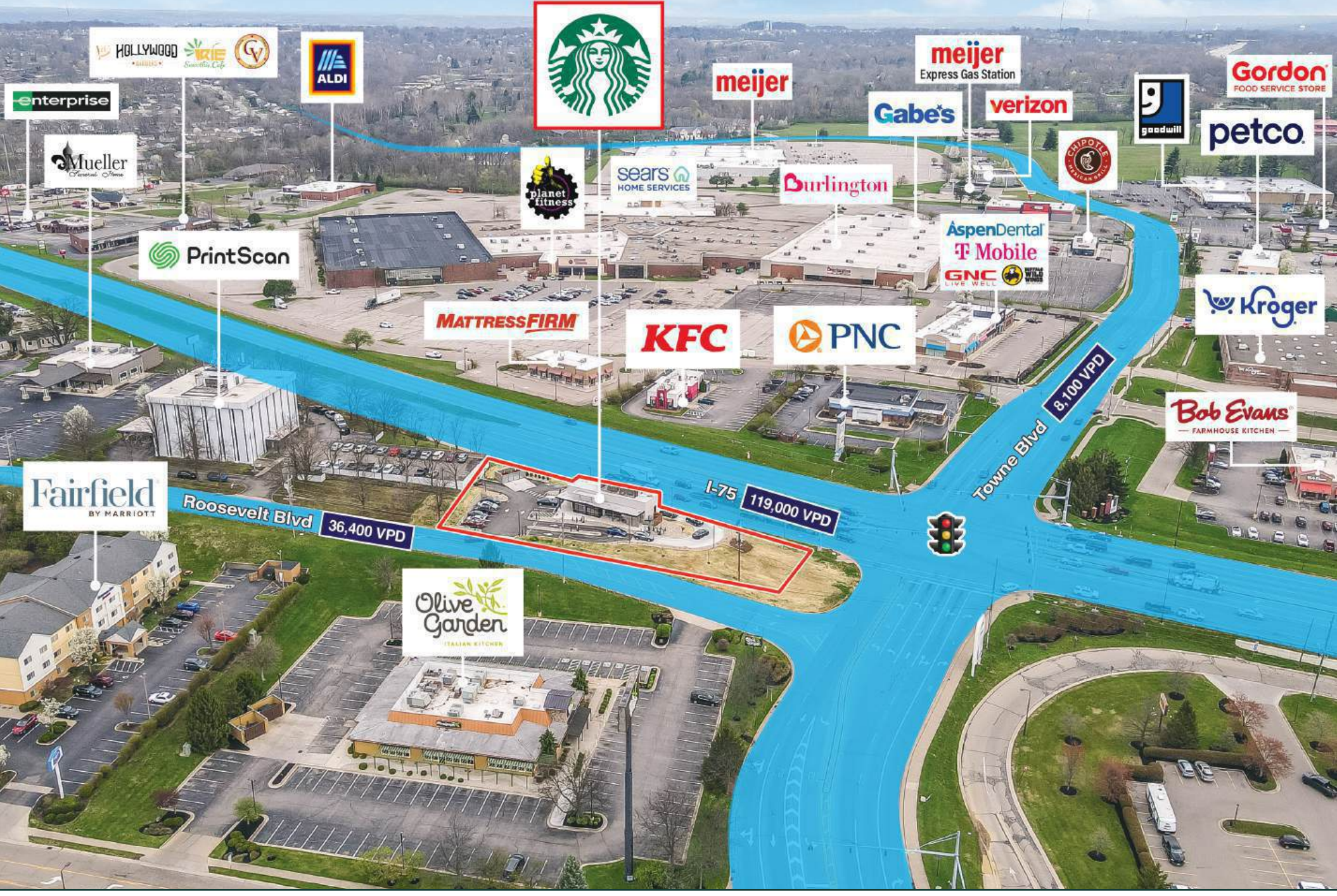
The information contained herein has been obtained from the owners or from other sources deemed reliable. We have no reason to doubt its accuracy but regret we cannot guarantee it. References to square footage or age are approximate. Buyer must verify the information and bears all risk for any inaccuracies. All properties subject to change or withdrawal without notice. Wertz Real Estate Investment Services, Inc.