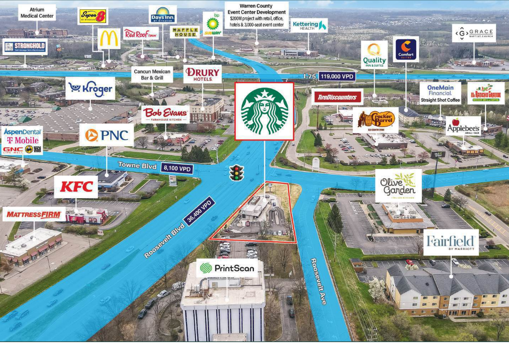
The information contained herein has been obtained from the owners or from other sources deemed reliable. We have no reason to doubt its accuracy but regret we cannot guarantee it. References to square footage or age are approximate. Buyer must verify the information and bears all risk for any inaccuracies. All properties subject to change or withdrawal without notice. Wertz Real Estate Investment Services, Inc.